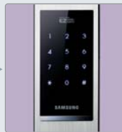
Keypad will display all numbers