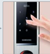
Enter your PIN code