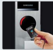
RF Key tag