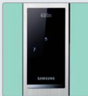
Press the displayed numbers in any order