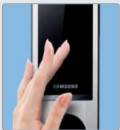
Press the activate button

2 random numbers appear before you enter the PIN code in order to stop copycat entries and prevent fingerprint tracing.