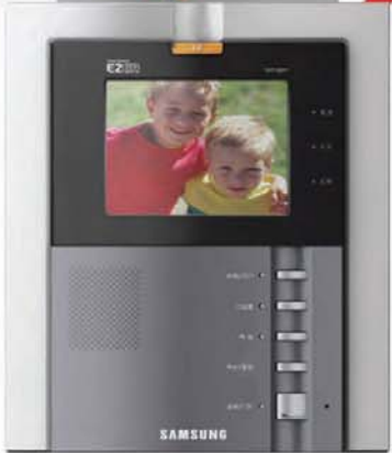
SHT - 6805 VIDEO DOOR PHONE